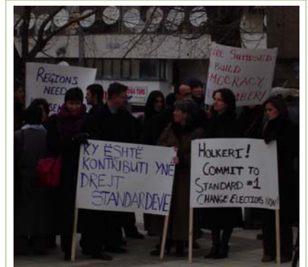
By advocating for election reform, NGOs demand that the first standard, democracy, be achieved

UNMIK needs to focus especially on stimulating the economy. First and foremost, Kosovo needs a speedy, transparent privatization process. UNMIK should conduct an analysis of the privatization process thus far and make this information public. In the future, the public should be more involved in the process, especially in monitoring for transparency. Changing the fiscal policy would also encourage investors to enter Kosovo. Encouraging European countries to recognize UNMIK travel documents and Kosovar license plates, allowing more taxes on imports that compete