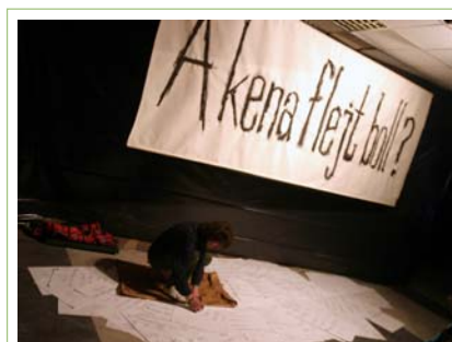
"Have we slept enough?" An art student asks Kosovo society and its institutions a hypothetical question regarding their apathy to react.

Now, we consider even more significant our mission of creating a government of the people, by the people and for the people.