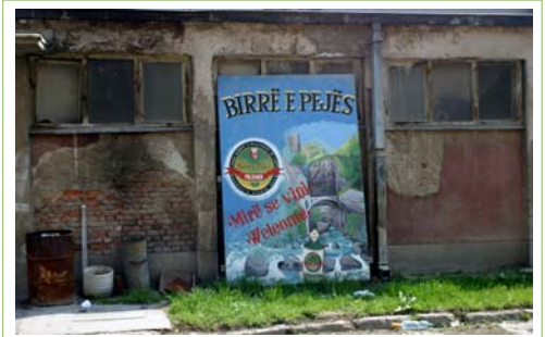
Birra e Pejes is one factory waiting to be privatized. Doing so would entice investors, allow for product expansion, provide new job opportunities and lead to thousands more Euros for the Kosovo consolidated budget through taxes.

Civil society needs to actively promote progressive causes and values. At the