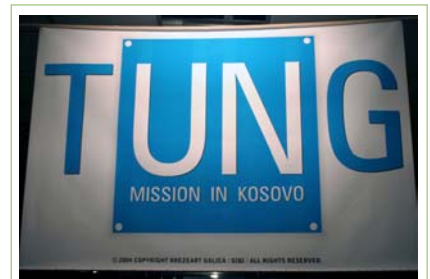
Citizen dissatisfaction could be seen in the weeks preceding the March violence, as demonstrated by this poster at an art exhibition at the Boro Ramiz shopping mall in Prishtina. "Tung" means "goodbye."

As people inside and outside UNMIK have commented, the institution is too soft. The UN itself has been described by its own employees as well as citizens as a "weak, ineffective