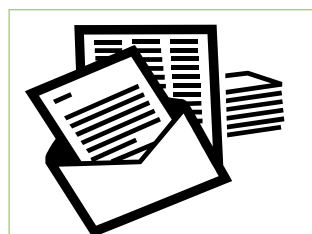
Letter-writing and e-mail campaigns can be an effective tool for making Kosovo voices heard and lobbying for certain issues.

NGOs should write a letter to the Security Council demanding that an independent group thoroughly investigate UNMIK's performance. Findings should be publicized in a report that details what happened and recommends how to prevent it from reoccurring. This report should include citizens' input, especially regarding potential failures