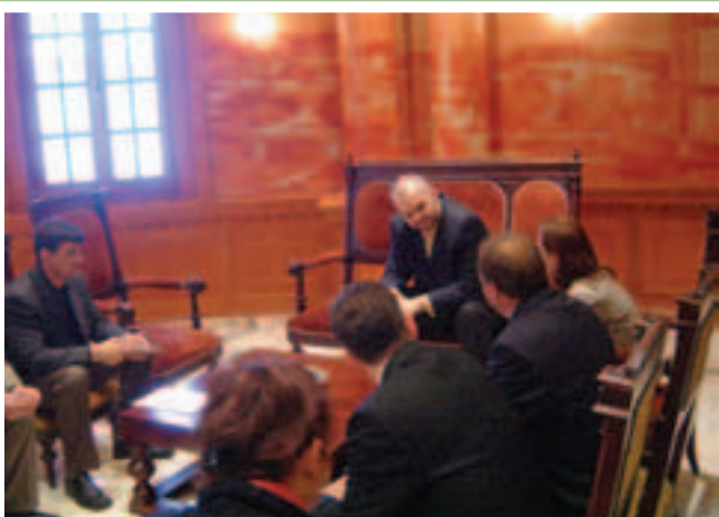
Consulting on cooperation between local government and NGOs

were represented by seven civil commissions that dealt with various aspects of development.