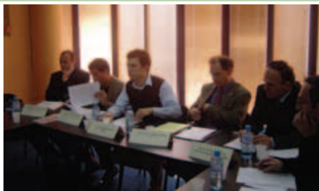
Mr. Haziri, Minister of Decentralization, explaining the pilot plan

Pristina, April 8. As part of our information and outreach program, ATRC organized a public discussion on "Decentralization and the Pilot Project" to inform NGOs and the public about the latest developments in this highly controversial plan. This was the first public debate to deal with this controversial plan, and more than thirty members of local, foreign and international non-governmental organizations attended. Local media such as the Pristina daily "Lajm" and "Koha Ditore" covered the debate. Decentralization in itself is not a controversial issue, actually