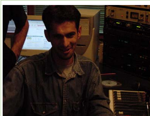
Staff working in the studios of Radio Kamenica.

This project, which will continue through February, was made possible through an FDI grant. ■