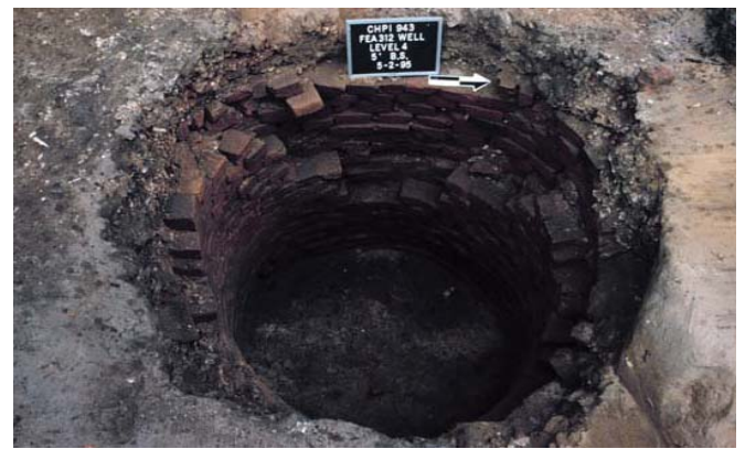
The population in rural areas is consuming polluted well water

population is not yet clear, people think that certain current deaths might be related to the contaminated water.