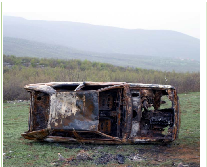
Car graveyards are the most common metal threat to the environment.