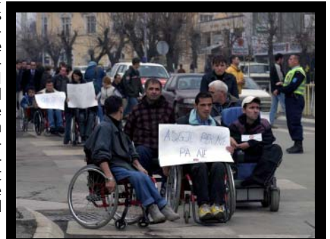
"Nothing for us, without us", citizens demand a role in the drafting of public access/construction laws at a rally in Mother Teresa Square. For the full story, "Handikos Rallies for Access..." see page 3.

More than 50 participants comprised of journalists, academics, NGO representatives and local and international governing authorities attended the lively discussion, which received wide media coverage from three national television stations and five daily newspapers.