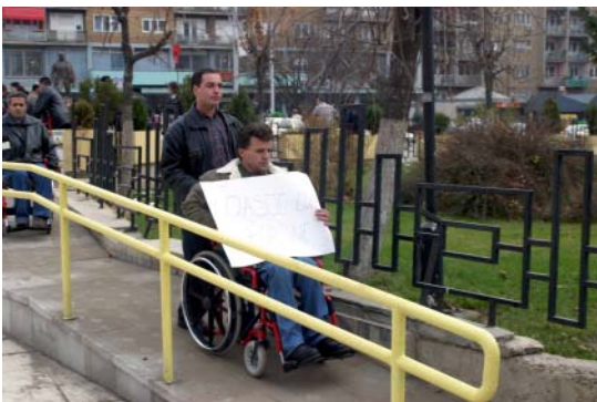
A citizen tries the newly opened ramp by Mother Teresa square, displaying his sign "access for us also."

onstration in "Mother Teresa" square as part of their project "Free Access for Everyone". It aims to advocate for laws and regulations with standards that create a physical environment without barriers.