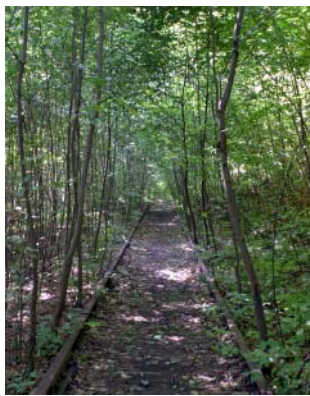
"The goal of life is living in agreement with nature." —Zeno

PRISHTINA, 22 Nov. — The Ministry of Culture, Youth and Sports/Department of Youth (DoY) started the consultation process on the preliminary draft of the Basic Youth Law prepared in cooperation with German Technical Cooperation (GTZ) and UNICEF. The process includes hearings, working groups, group discussions, seminars, etc. with different stakeholders, including local youth NGOs. The draft will be submitted to the Ministry by 15 Dec. 2003.